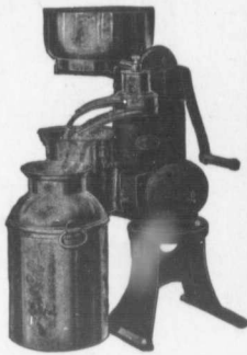
The favorite everywhere it goes. Note its heavy and heavy compact construction, with low-down, handy supply can only 1/2 ft. from the floor.

It is desirable to mention the name of this publication when writing to advertisers.