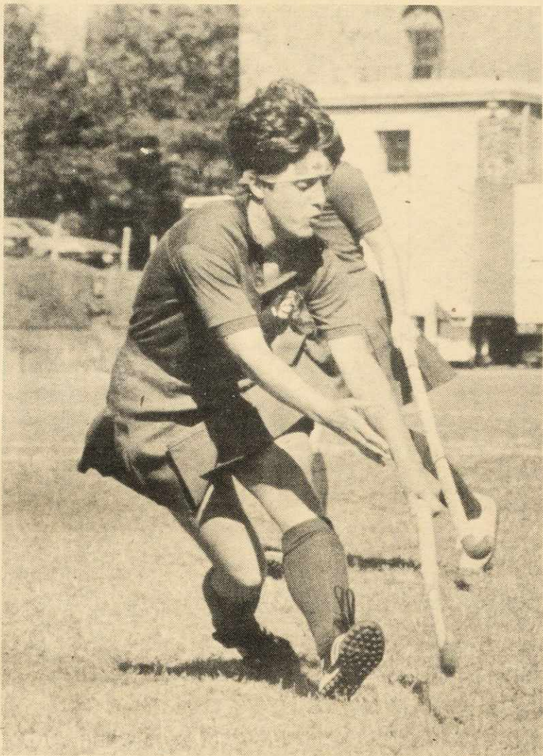
Tigers kept their undefeated streak going with a big win over St. Mary's Huskies last Saturday.