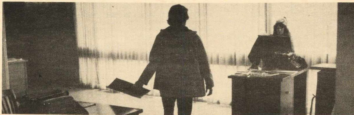
JOURNAL office, Saint Mary's University.

Actions like that of the JOURNAL are only one way of overcoming the "ivory