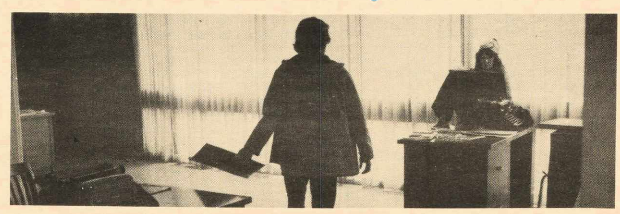
JOURNAL office, Saint Mary's University.

towerism" of all university campuses. What must be done is to go into the community, to work with the people struggling there and to form a mass support for the revolution that is so eminent in this society.