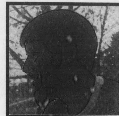
Joey Jo-Jo Shabadu - Hairface II