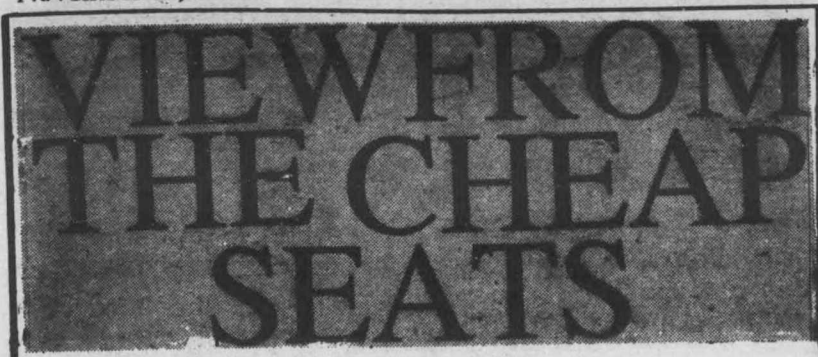
By Tim Lynch

Recent CIAU exposure revealed different results for UNB Athletics. Both the Red Harriers and Red Sticks competed in national championships, and the results were different.