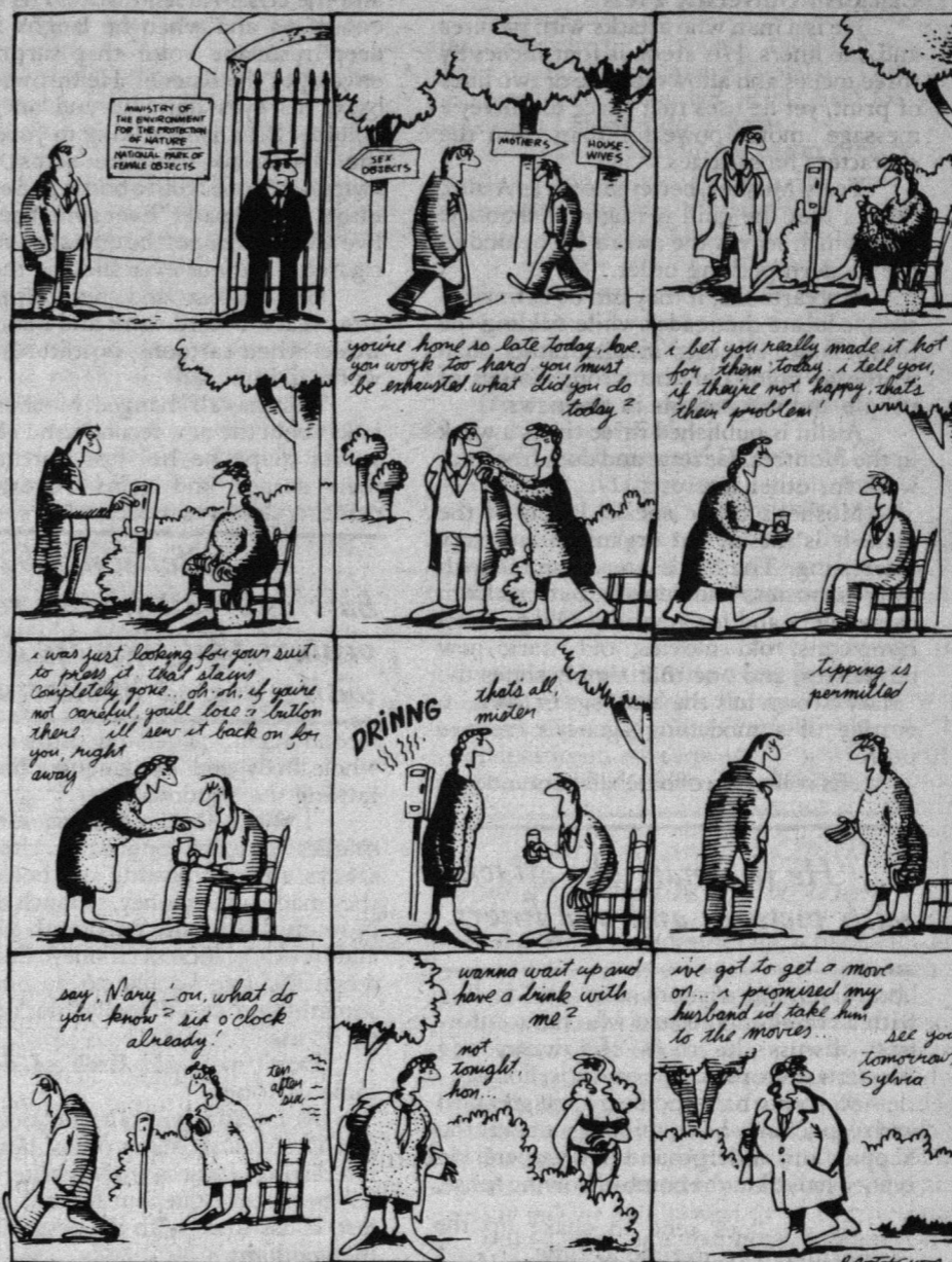
Claire Bretecher (France) NATIONAL LAMPOON PRESENTS CLAIRE BRETECHER, 1978. (USA)