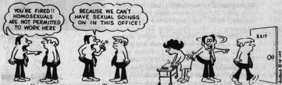
Bulbul, LNS NEWS SERVICE, 1978. (USA)

I would rave at length about individual cartoons but the space is better used to display them. Go see the rest yourself. Even the bad ones are interesting from a pathological angle, and the good ones will make your day.