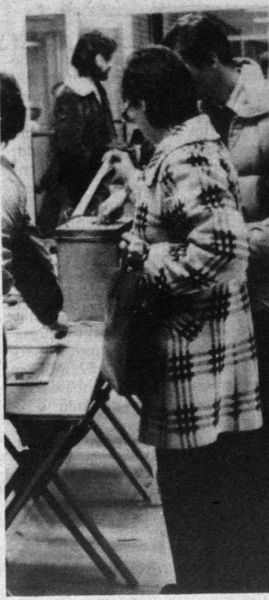
Two of the thirty students