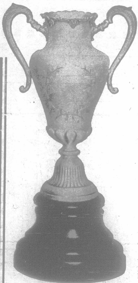
This is one of four cups donated for the Best Horse, Beef Animal, Dairy Cow and Pen of Bacon Hogs shown at the Guelph Fat Stock Show this year.