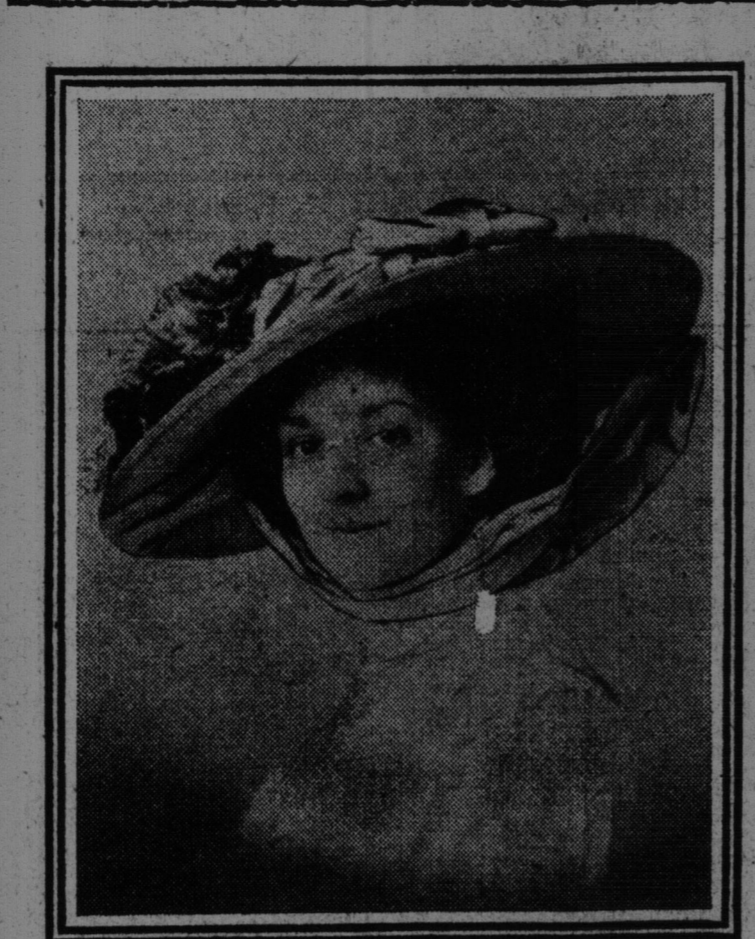
A TWO-TONE MODEL

The new summer shapes are so graceful that even though they do set fairly around the head, they are immensely becoming. One of these big hats with their curled-up brims are built of straw braid over light frames, even the leghorns.