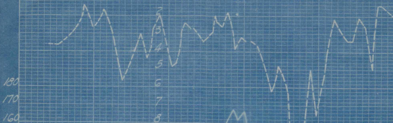
1 Commercial Failures in Thousands

180 170 160 150 140 130 120 110 100 90 80