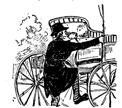
GETTING INTO MY RIG WAS AGONIZING.