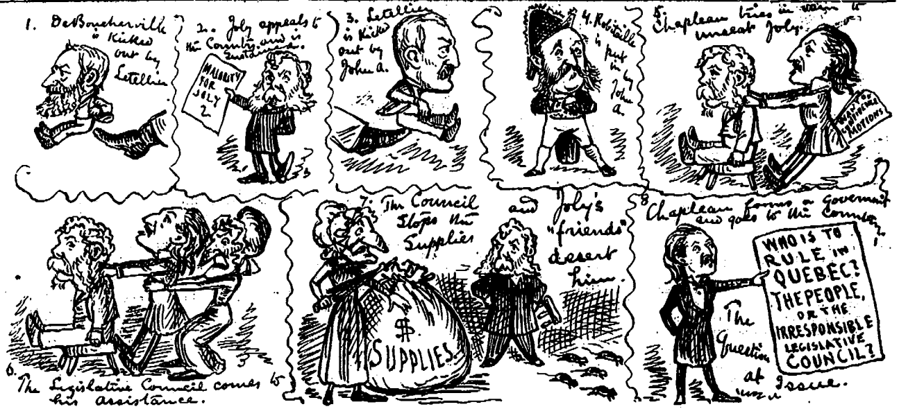
THE FACTS IN THE QUEBEC CASE RECAPITULATED.

Oh wad some power the gift to gie us To see ourselves as ithers see us!