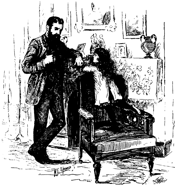
A PUZZLING QUESTION.

PAPA: Ethel, you must n't say "I won't" to Papa. It's naughty. ETHEL: Well, but Papa, what shall I say when I mean I won't?