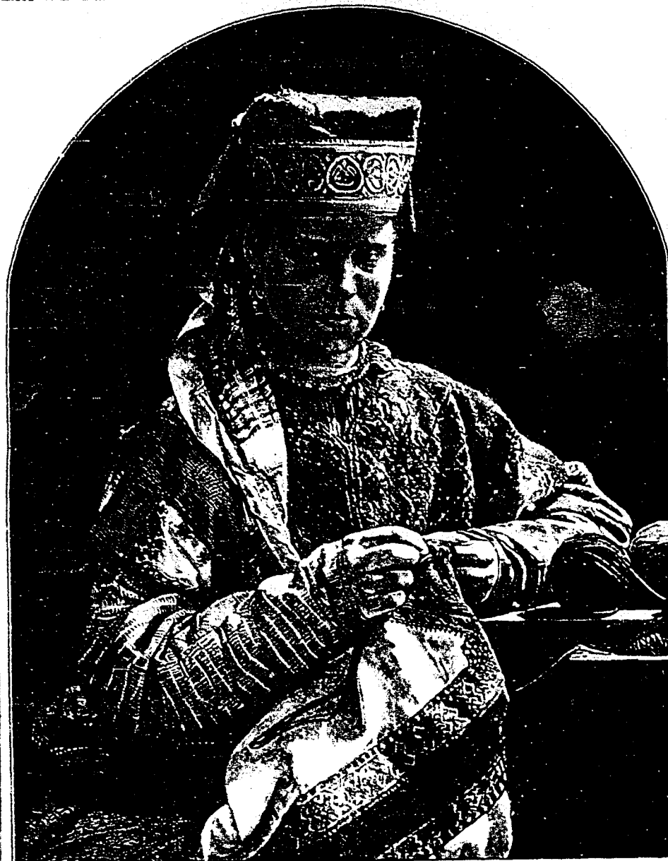
A MOLDAVIAN PEASANT GIRL.