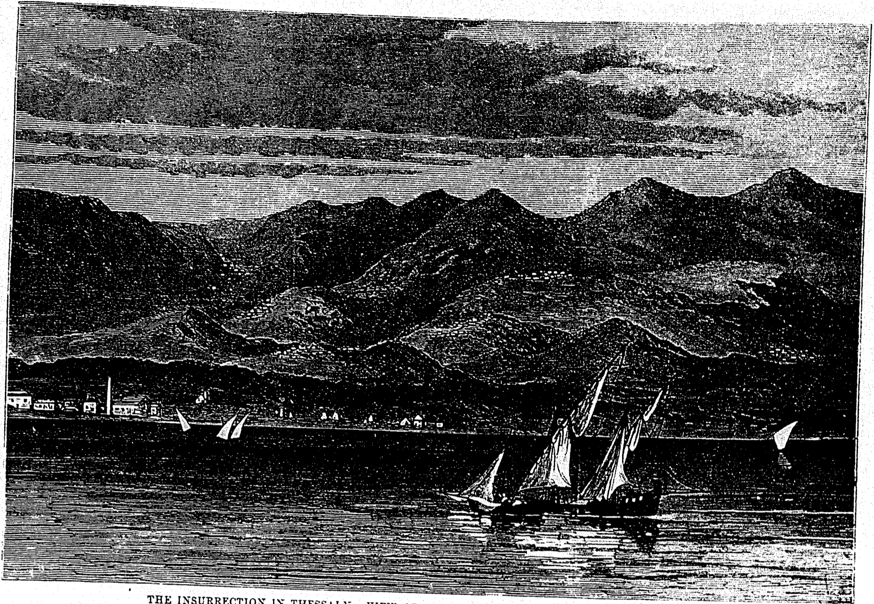
THE INSURRECTION IN THESSALY. VIEW OF VOLO WITH MOUNT PELION IN THE BACKGROUND.