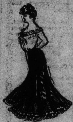
White Under- skirts, Extra Value for 95c.