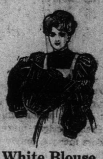
White Blouse. Regular 45c. Now 39c.