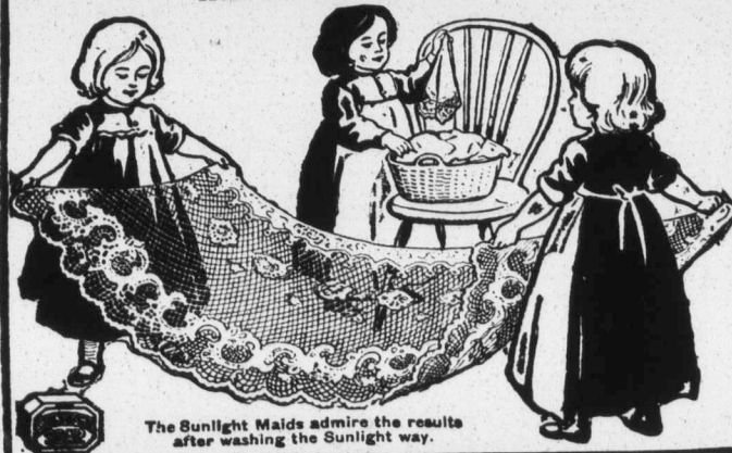
The Sunlight Maids admire the results after washing the Sunlight way.

5c. FIVE CENTS 5c. LEVER BROTHERS LIMITED, TORONTO 1010