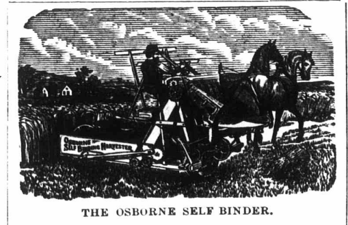
THE OSBORNE SELF BINDER.