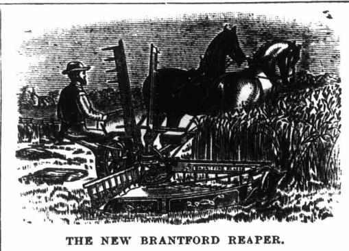
THE NEW BRANTFORD REAPER.

For full particulars send to GLOBE WORKS, London, Ont. 183-c