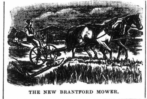
THE NEW BRANTFORD MOWER.