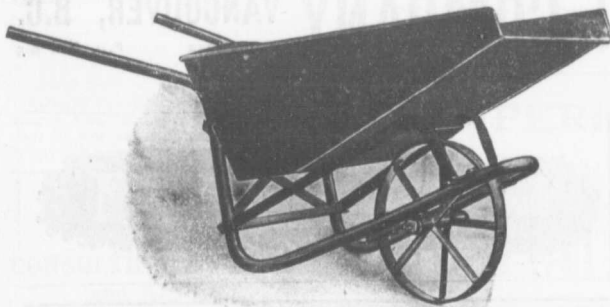
No. 8 "Concrete Conveyor."

Carry 50 per cent. greater load than the ordinary barrow with less exertion in pushing and dumping. Weight carried well over wheel which is ROLLER BEARING. Best materials used throughout. Strongly braced and bolted.