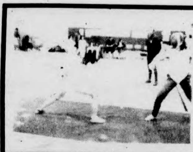
York's fencers will be holding a fencing demonstration at the East Bear Pit on Wednesday, April 3. The show last all day, from 8 a.m. to 8 p.m., so come and check out the action.