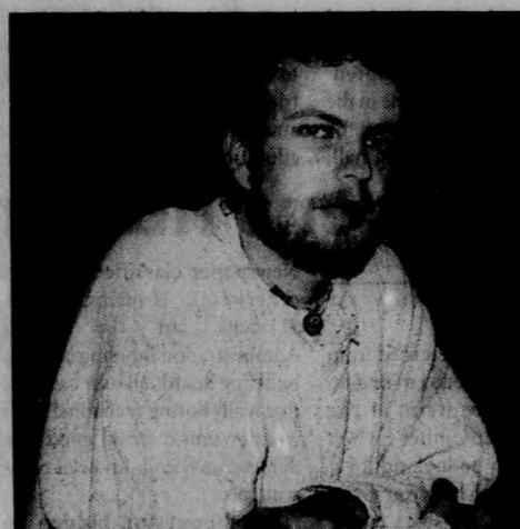
ZIPPO ARTS (3) "Every second Thursday."