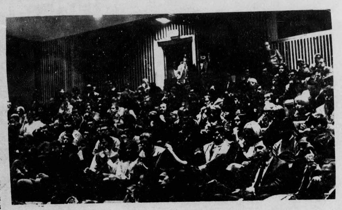
A concerned group of students and faculty gathered for answers in McLaggan Hall Wednesday night at the special SRC meeting. An overwhelming majority of the onlookers favored immediate dialogue between the SRC and the deans. The SRC brunswicken came but where were the deans?

"Not to strike would be an implicit acceptance of the board of deans' ability to act in any arbitrary fashion it deems fit; to exist and act as a body responsible only to stself, without recourse to the suggestions and recommendations of the student population and . . . the SRC.