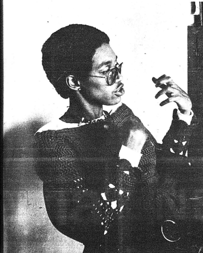
...with her particular rendition of playful, swinging rhythms.