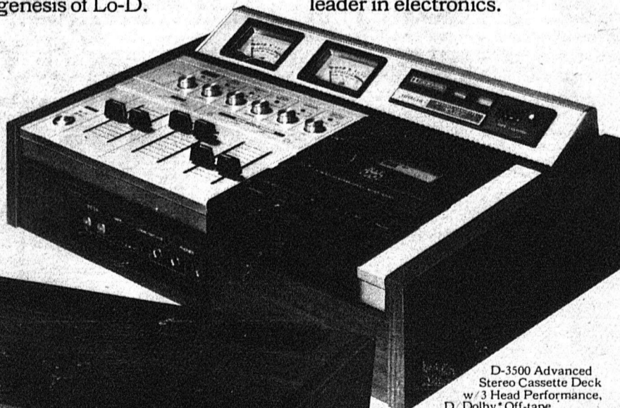
D-3500 Advanced Stereo Cassette Deck w/ 3 Head Performance, D Dolby* Off-tape monitoring, S/Nw/Dolby: 63 dB Wow and Flutter: 0.05% (WRMS)

The kind of achievement that has made Hitachi a world leader in electronics.