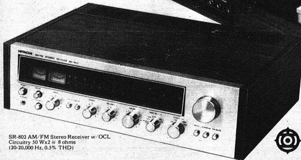
SR-802 AM/FM Stereo Receiver w/OCL Circuitry 50 Wx2 @ 8 ohms (20-20,000 Hz, 0.5% THD)