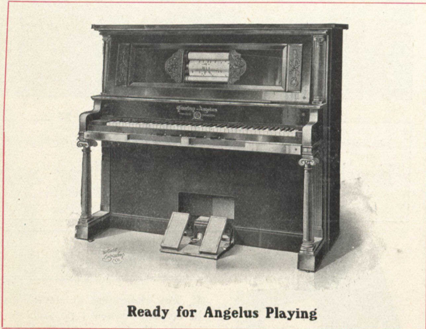
Ready for Angelus Playing