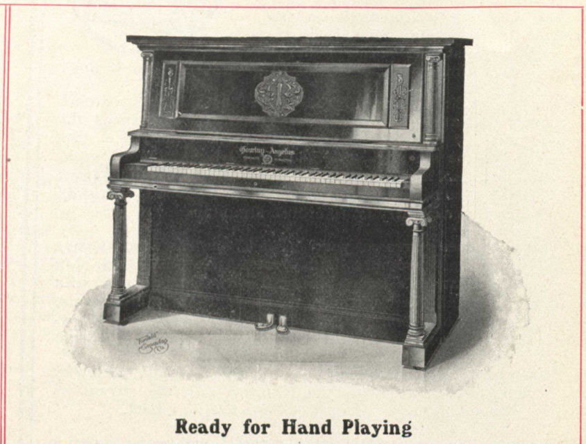
Ready for Hand Playing

Is unrivalled because of its exclusive improvements—