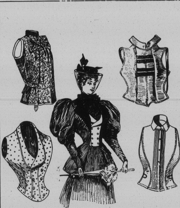
VESTS AND CHEMISETTES.

I think there is another class still, and a more numerous one than the casual observer might imagine, of women who, poor as they are, yet retain a certain obstinate pride which would make them consider that they lowered themselves in the eyes of their