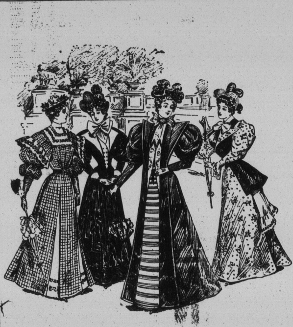
STYLISH OUTING COSTUMES.

ever washes properly, while the woman who makes it a regular rule to crawl out of bed either into a tub of steaming hot, or ice-cold water, just as her constitution demands, would deem it very im-