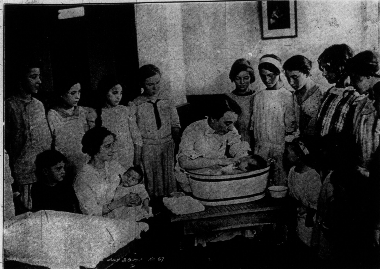
THE LITTLE MOTHERS GIVE CLOSE ATTENTION AS THE NURSE SHOWS HOW TO BATHE THE BABY.