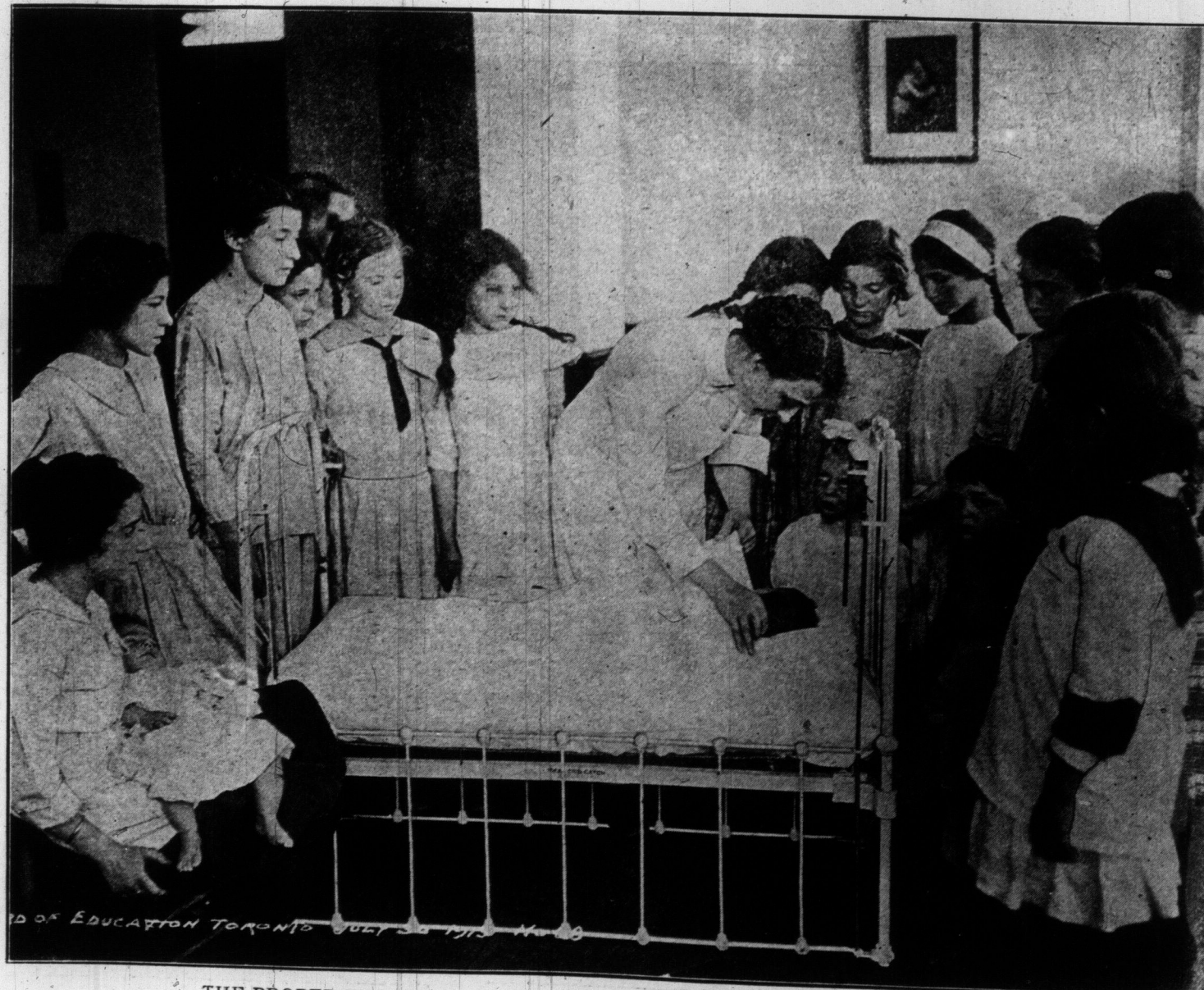
THE PROPER WAY TO PUT THE BABY TO BED—IN THE McCAUL SCHOOL CLASS.