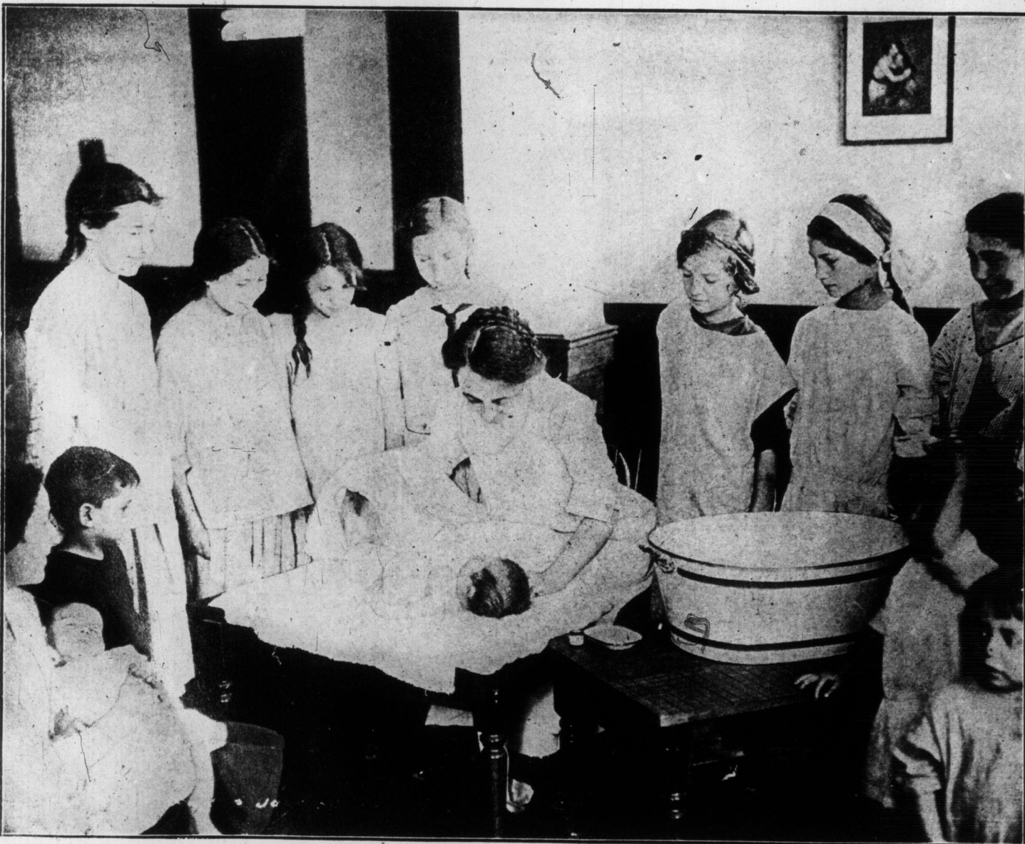
THE NURSE EXPLAINS HOW THE BABY SHOULD BE DRESSED—EVERY SCHOLAR CAN SUPPLY ONE OR TWO LITTLE SUBJECTS FOR OBJECT LESSONS.