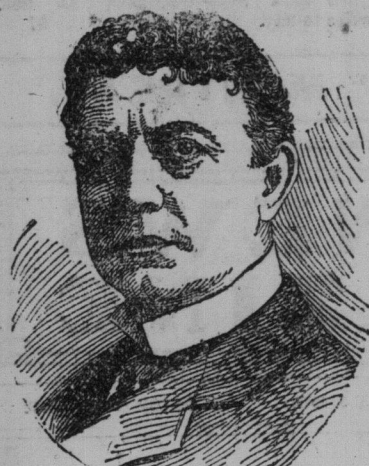
ROBERT B. MANTELL.

Mr. Mantell at the Grand. Supported by one of the strongest organizations on the road, and with entirely new costumes, properties and scenery, Mr. Robert Mantell, Toronto's favorite actor, commences his annual spring engagement at the Grand Opera House next week. Mr. Mantell's repertoire is complete with dramas and tragedies, representing the masterpieces of the world's famous authors.