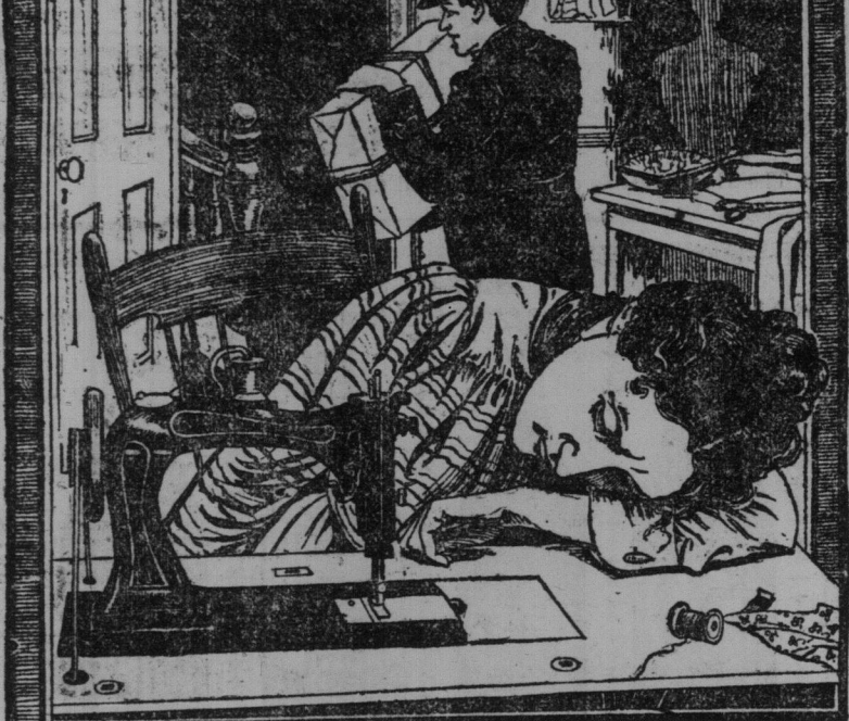
Six Years' Suffering Cured.

For the society queen and the dressmaker alike, there is nothing so reliable as Lydia E. Pinkham's Vegetable Compound to restore strength, vigor, and happiness.