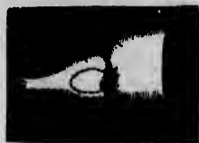
Fig. 14. Perca.