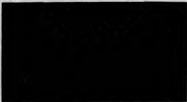
Fig. 12. Diagram of ganoid brain.