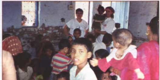
Volunteers from the Canadian High Commission have been donating their time on National Immunization Sundays since 1998, contributing to the vaccination of thousands of children under the age of five in India's Intensified Pulse Polio Immunization Campaign. Eradicated in the developed world, polio in India accounts for 75% of the world's cases.

How Many Babies? In Canada, 39 babies are born every hour; in India, every hour brings 1,800 babies.