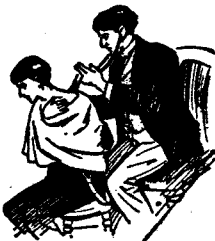
PATIENT UNDER EXAMINATION.