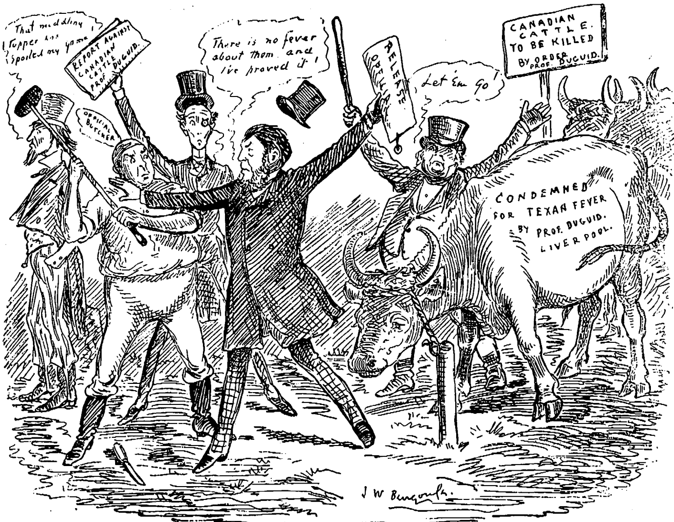
TUPPER TO THE RESGUE!