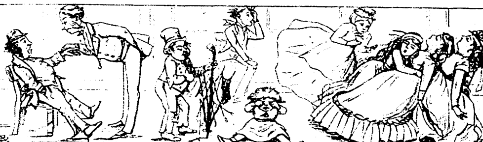
THE EVENING'S RECEPTION.