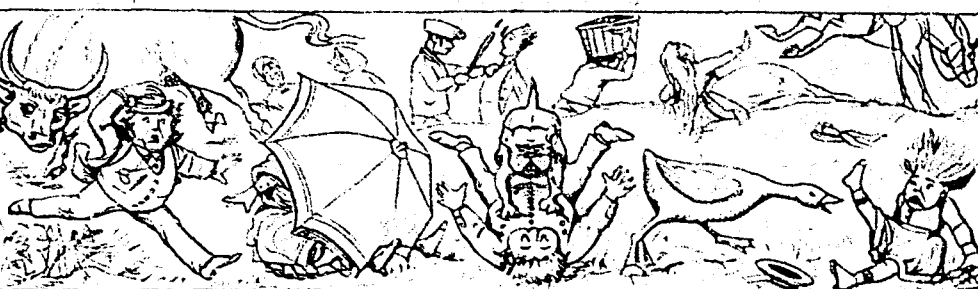
A FEW VARIETIES OF COUNTRY LIFE.