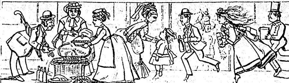
THE PREPARATION FOR SEATING.