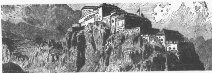
FORTRESS IN THE CLOUDS—ESSEILON, ITALY.

Specimen of over 100 Cuts illustrating "Canadian Tourists in Europe."