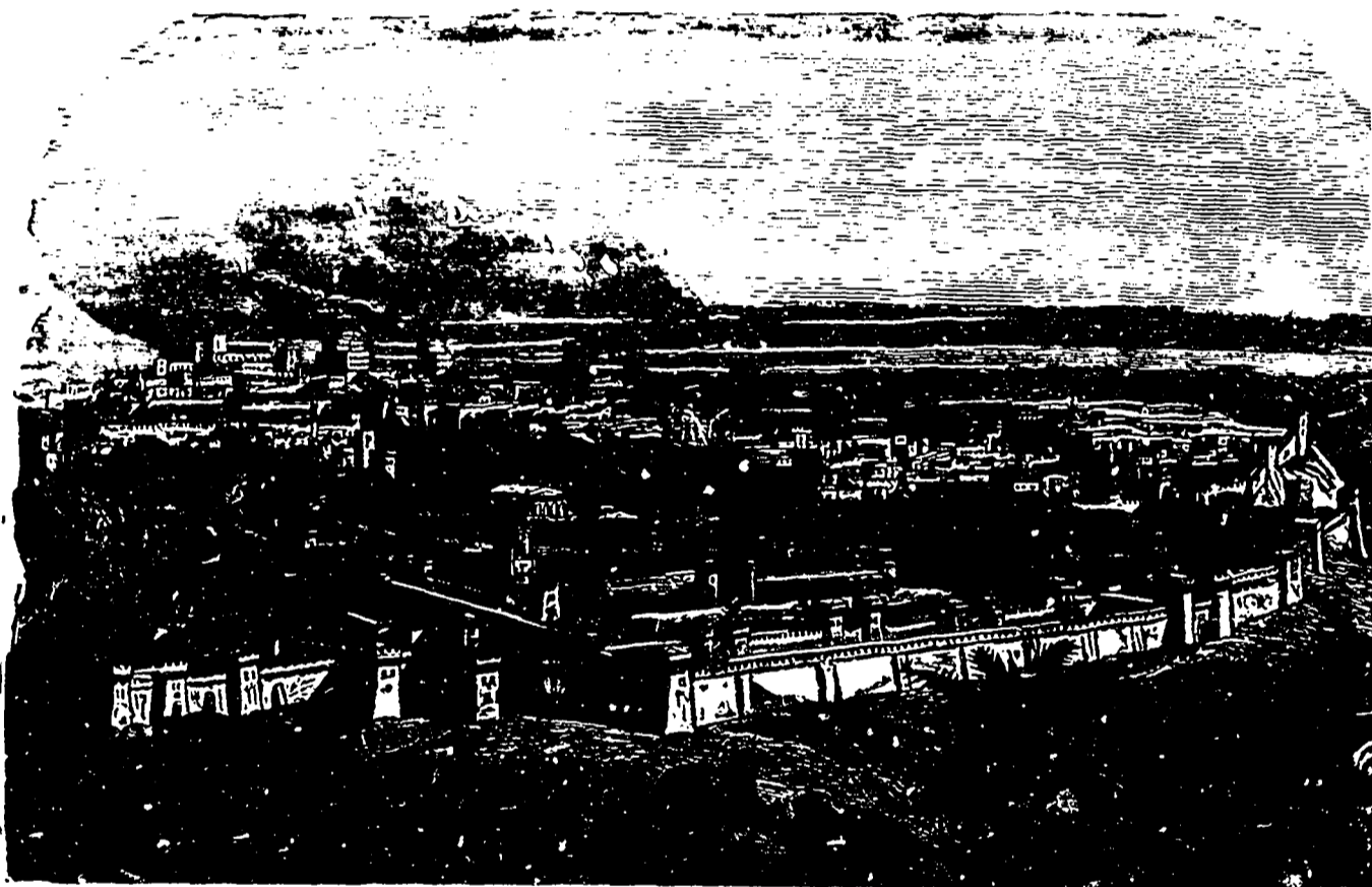
JERUSALEM RESTORED BY NEHEMIAH.