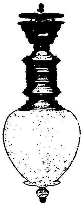
STYLE No. 200. D. B. Trim. Brass.

You are invited to investigate our A. C. Series Enclosed Arc System.