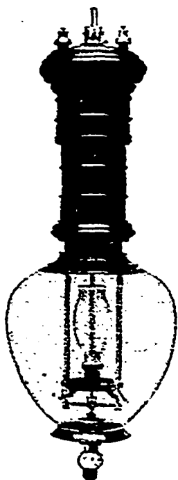
STYLE No. 252. D. B. Trim. Iron.