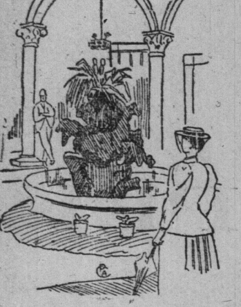
COURT IN GUATEMALA BUILDING.

ing and more than as much more in getting a representative display of its resources. This last was an arduous task, since the gamut of products and natural "r" is run from the animals and plants, much to the surprise of the visitor, to the grains and cereals of the temperate zones and the woods and vegetation which adorn the regions next the arctic.