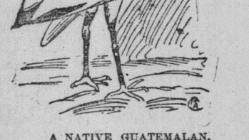
A NATIVE GUATEMALAN.

Guatemala had two distinct aims in building at the Fair. President Barrios insisted that the world and fortune hunters in particular should be given a chance to know how rich his Central American republic was in undeveloped commerce in every line. He also wanted the splendid silk life shows as much as possible to be seen in Guatemala. Too often, he feared, all life in his capital was looked upon as akin to Indian usages and this idea he wished corrected. Consequently splendid samples of silk tapestries and hangings, and photographs of great theaters and rich mansions came along with the articles of barter. He wanted the books contra-