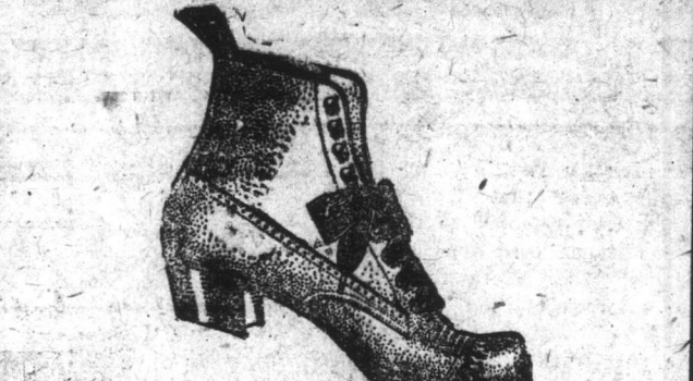
Only $4.75 This is a smart Dark Tan Laced Boot easily worth $6.00 per pair.