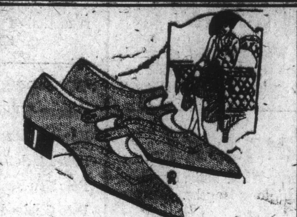
Ladies' Two Tone Canvas Boots, Cuban Heel, only $2.00 per pair

LADIES' LACED and STRAP SHOES in Black and Tan leathers; Low, Military, Cuban and Louis Heels.