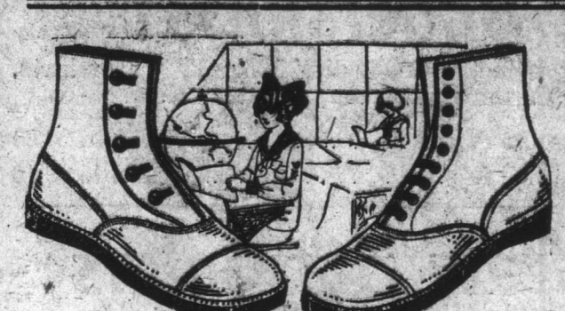
Children's White Canvas Skuffler Laced Boots, only $1.50 per pair

After the death of the Regent of the Scots—Sir Andrew Murray—Robert the steward was appointed sole govern- or and his first act was to send the Knight of Liddesdale to the King of France for help against the English; and then, about the end of April, 1339, he laid siege to Perth. The siege had lasted ten weeks, and the Scots were about to give it up, when five French ships of war, with the Knight of Lid- desdale—who had executed his com- mission with well-timed success—ap- peared in the Tay. The siege then proceeded with renewed vigour, and during its progress there occurred a striking incident. In the midst of the military operations on July 7, and soon after noon, the sun was eclipsed; for a short time there was nearly to- tal darkness, and the eclipse lasted on the whole for nearly two hours and a half, during which the soldiers of both armies forgot their strife, and gazed in terror into the sky. But the leader of the besiegers—Sir William Bullock, who had been Balliol's Chan- cellor and had deserted his master— unintimidated by what was thought to be a sign of divine death, redoub-