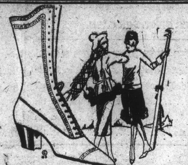
Ladies' White Canvas 2-strap Shoes Cuban Heel, only $2.00 per pair