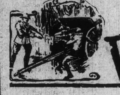
Article No. 8 Cut out for Reference