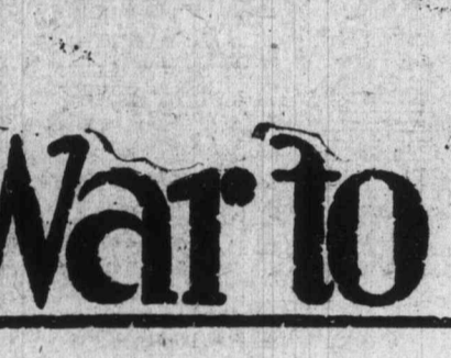
Article No. 8 Cut out for Reference

In each employment office there is a representative of the Department of