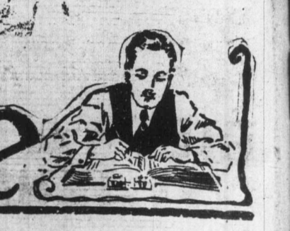
Article No. 8 Cut out for Reference

In each employment office there is a representative of the Department of