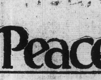
Article No. 8 Cut out for Reference

In each employment office there is a representative of the Department of