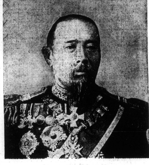
PRINCE HIXOBUMI ITO.

weakness. Corto, who kept Sanzone in touch with the movements of the Black Hand men, was the first witness called. S. F. Washington questioned him in