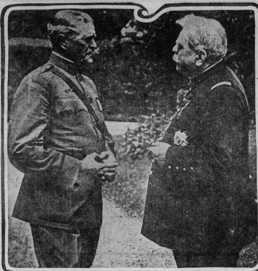
Marshal Joffre and General Pershing at the historic meeting at the Hotel Invalides, in Paris.