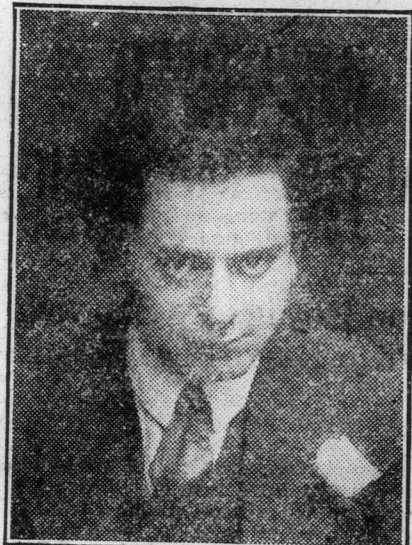
The world famous 'Cellist, who will like to play at the Patriotic Concert in the Opera House to-morrow night.