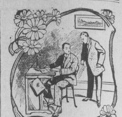
A Well Equipped Office

Don't tear your old roof off because Agent.