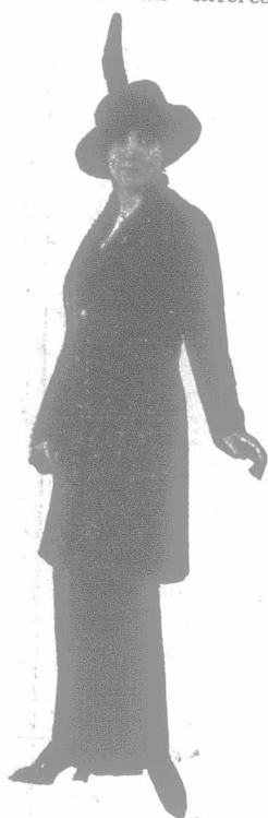
Grey Suit Dyed Blue

Recoloring clothes at home is to thousands of women a simple process. They find it an interesting, money-saving way to employ their spare time.