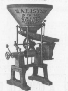
The New Lister Grain Grinder

Quite a number of farmers over Ontario are now installing electric lighting systems for their barns and homes. The Lister people make up the needs of any size of farm buildings. An engine of 3 H.P. will supply plenty of power for most cases, and of course could be used for scores of other old jobs when not running the lighting plant. In another part of the tent was the exhibit of Melotte Cream Separators. Most farmers over Ontario know the Melotte, and know it for its easy running and durability. The man in charge explained that there are already in Canada alone over 50,000 of these separators. The writer came across a farmer in the West a few years ago who had run a Melotte for seven years, and his only expense was for oil and a few rubber rings.