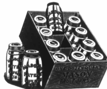
Mason Fruit Jars —Always reliable. Pints, Quarts and Half Gallons. The most popular Fruit Jar ever manufactured. Extra Rubbers, Tops or Jars.