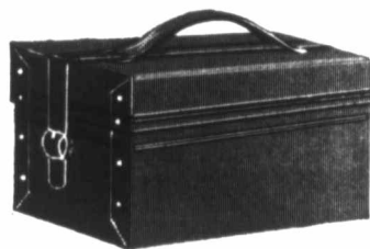
Brownies Improved Fibre Lunch Boxes —Will nest : No. 0— 8\frac{1}{2} \times 6\frac{1}{2} \times 5 No. 1— 7\frac{3}{4} \times 5\frac{1}{2} \times 4\frac{1}{2} No. 2— 6\frac{3}{4} \times 5 \times 4\frac{1}{2}