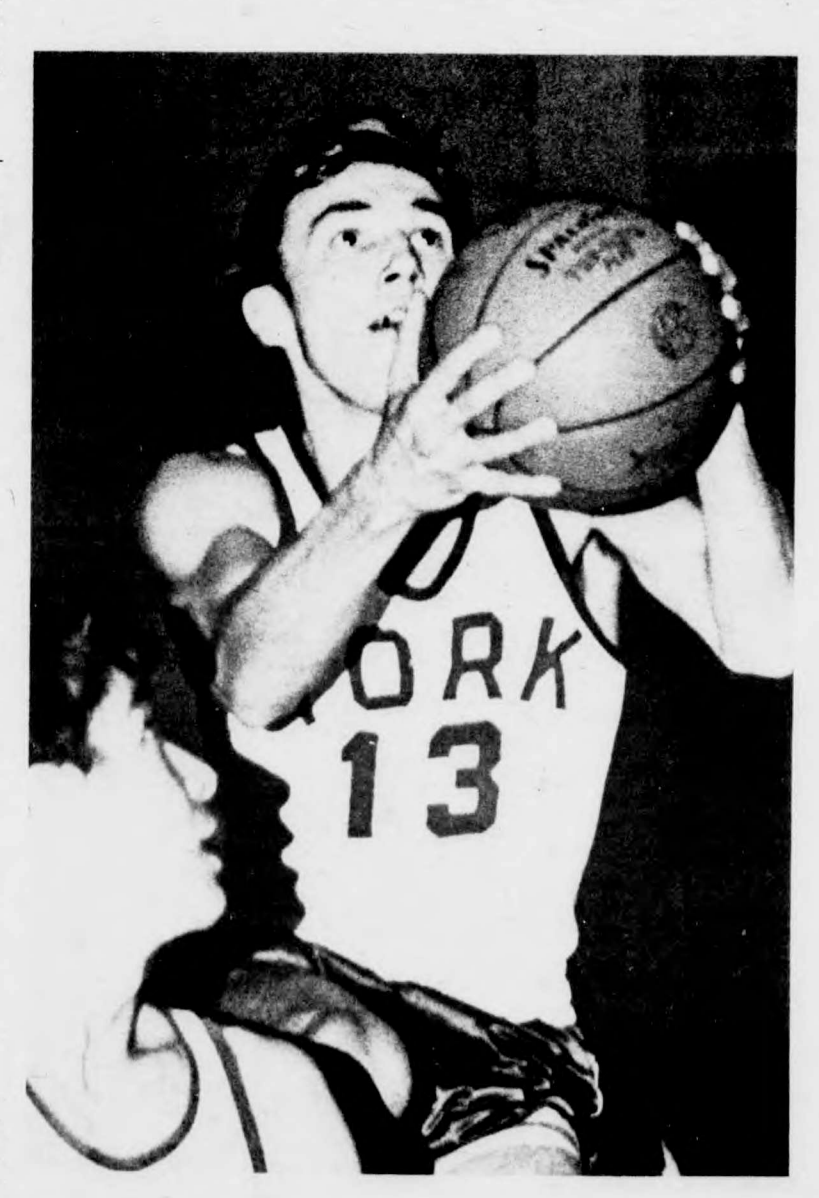
by Howard Tewsley

Special notice to layout staff. Please make sure you know how to compute headlines, inch copy, and avoid mistakes. Special notice to all Excalibur writers: Set typewriter margins for a 64character line. As you can see, Excalibur readers, the communication around this place is fantastic.