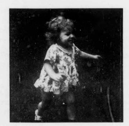
L'il Lulu - BSc.FOR -XIV

Invest it so I might have enough for tuition oneday.