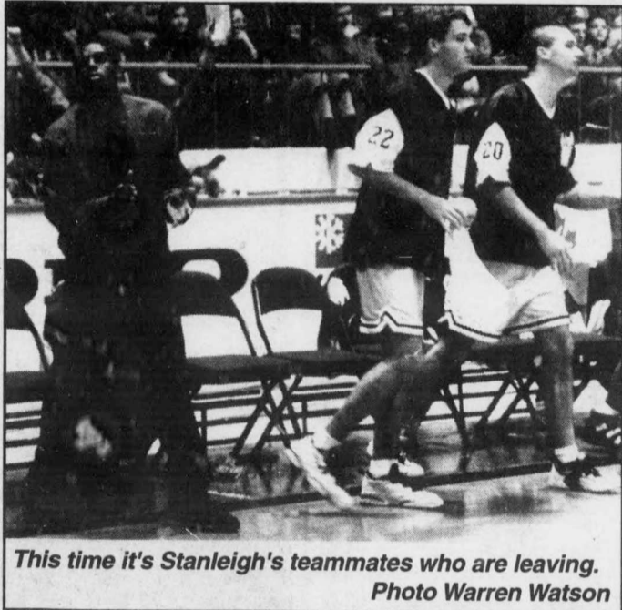
This time it's Stanleigh's teammates who are leaving.